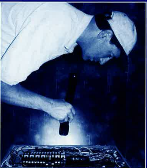
Visual inspection of the main electrical panel.

At the conclusion of the inspection, you will receive a Bass Home Inspection, Inc. folder with your easy-to-read computer-generated report along with the ASHI Standards and Code of Ethics.