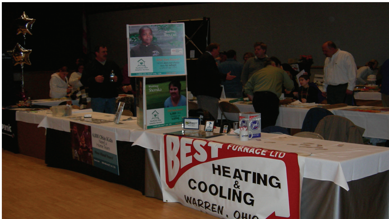
Trade Show Booths

Columbiana County saw a slight decrease in units sold from a pace of 46 units in December 2008 to 39 in January 2009, and actually 39 units that sold in January 08'. The average sold price for January 09' decreased to $54,674 from $65,512 in January 08' and below December 08' average of $69,035.