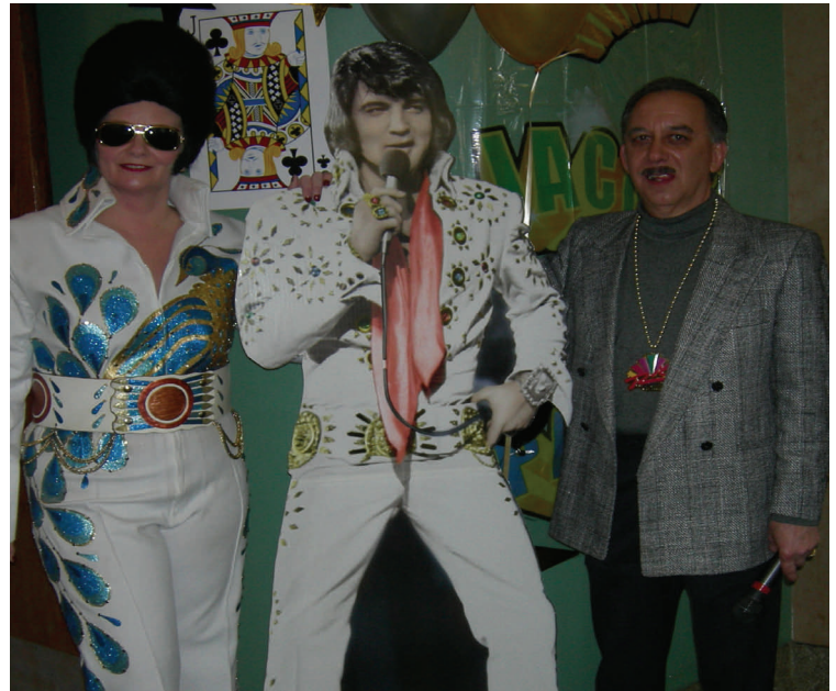
Look who showed up at our Trade Show!!!