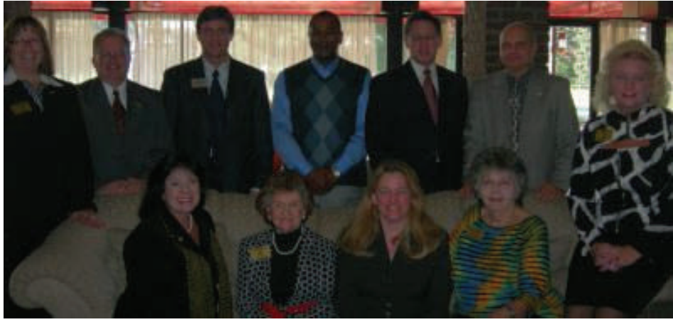
RPAC Brunch held at the Trumbull Country Club on November 12, 2009