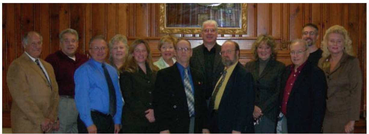
Brokers and Past Presidents Breakfast held at the Mocha House on November 6, 2009